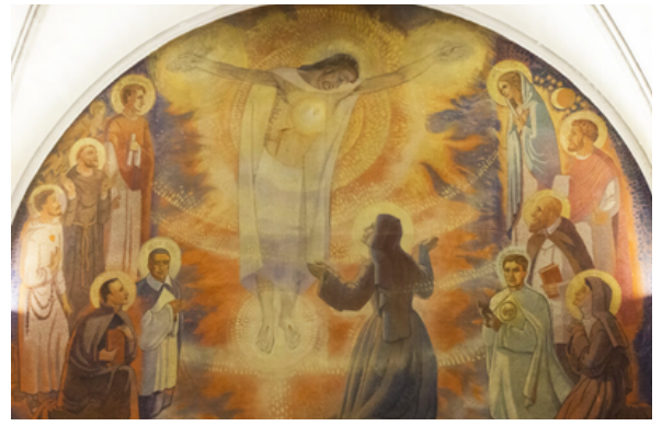
Chapelle des Apparitions, Paray-le-Monial, France

“My divine heart is so inflamed with love for men, and for you in particular, that no longer being able to contain within itself the flames of its burning charity, it has to spread them through you, so that it is revealed to them in order to enrich them with its precious treasures which I am revealing to you.”